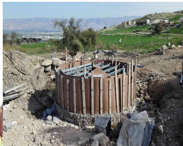
Himmeh Springs during and after Rehabilitation