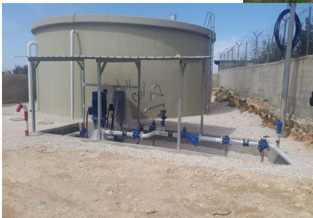
Springs after Rehabilitation